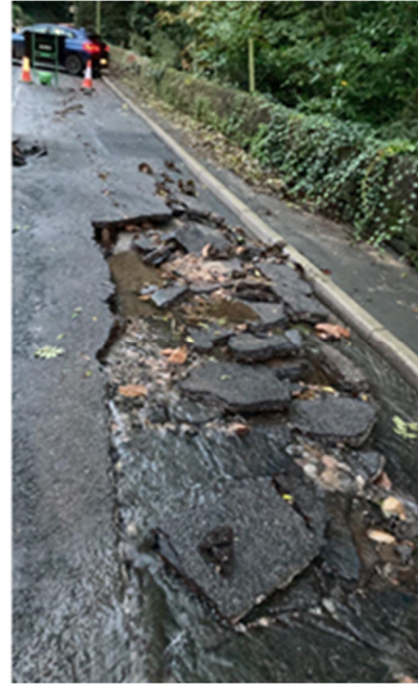
25 October 2023 Severn Trent Burst on diversion route for Leashaw landslide